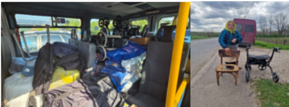
Photos- Much-needed equipment.